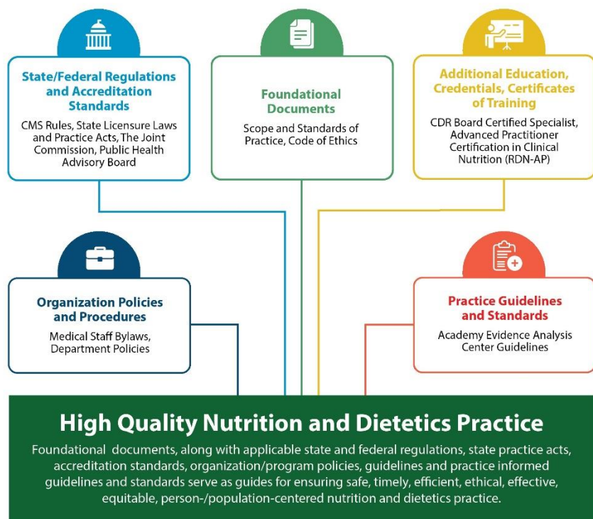
Figure 3. Elements of High Quality Nutrition and Dietetics Practice