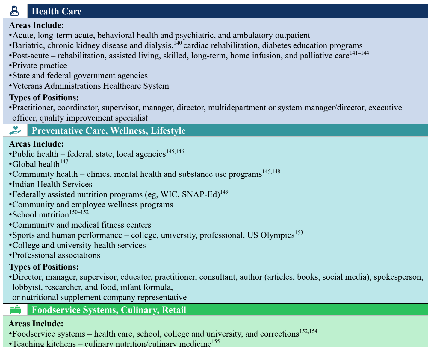
Figure 5. Practice Areas for RDNs

Core education and supervised practice, work, and volunteer experiences, targeted continuing education and applicable certifications have greatly expanded opportunities for RDNs. Figure 5 highlights a variety of practice areas where individuals would find RDNs serving as practitioners, supervisors, managers, directors, vice-presidents, chief executive officers within organizations or across systems, educators, researchers, media spokespeople, authors, website developers, sustainability leaders, state and federal agency directors or staff or any other type of position the RDN wants to pursue consistent with interests, qualifications, and individual scope of practice.