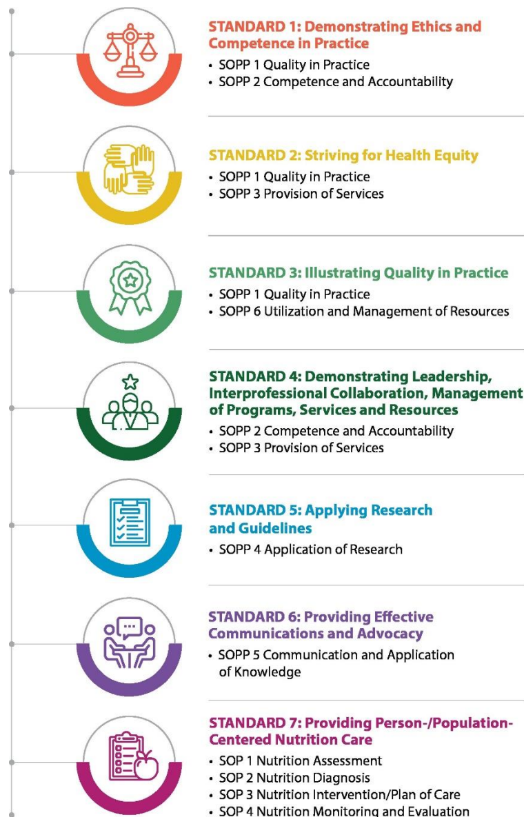
Figure 2. Standards Crosswalk. Crosswalk of 2017 Standards of Practice (SOP) and Standards of Professional Performance (SOPP) to the seven 2024 Standards.

Scope and standards documents are reviewed and revised every 7 years. In the 2017 revision, the Scope of Practice for the RDN 9 and the Standards of Practice (SOP) in Nutrition Care and Standards of Professional Performance (SOPP) for RDNs 10 were two separate documents. The two figures in the Revised 2017 SOP in Nutrition Care (4 standards) and SOPP (6 standards) for the RDN have been combined into one figure in the Revised 2024 article with 7 standards as outlined in Figure 2 . Additionally, combining the scope and standards documents and figures reduces repetition, improves readability and accessibility, and recognizes the changing practice environment toward efficiency.